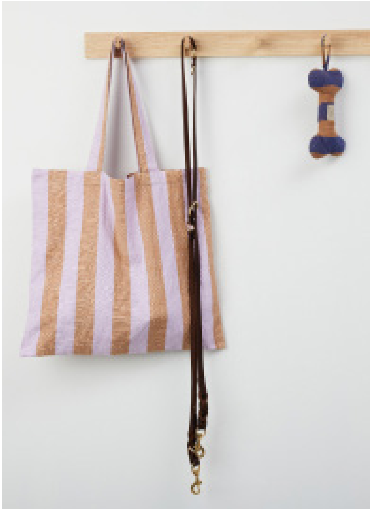
Zoo Tote bag